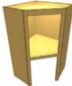
UCANGAG Upper Cabinet Angle Appliance Garage Fixed Depth

Angled upper cabinet with 12in-16in sides and an 18in tall appliance garage. Note: The order height of your cabinet should not include the additional 18in height. Example: If you order this cabinet 30in tall then your cabinet will come 48in overall height. Five minute assembly time. Available with up to three adjustable shelves.