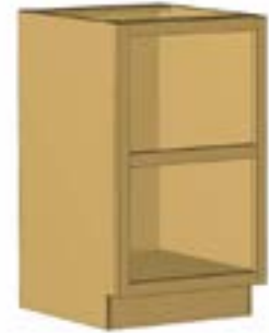
BCD2EO Base Cab 2 Drw Equal Opening

This is a 2-drawer base cabinet with equal openings. Works perfectly as a filing cabinet.