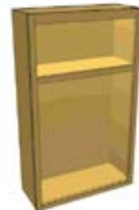
UCDBLFO12 Double Upper Cabinet Fixed Opening 12in

This is a double upper cabinet. It has a 12in fixed opening on the upper section and a variable height bottom opening. Available with up to three adjustable shelves.