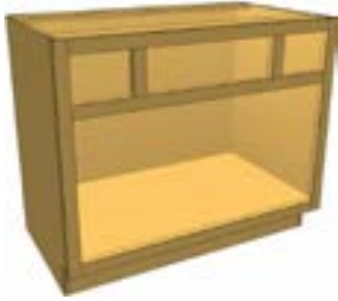
BCVCD2FO16 Vanity Cabinet Fixed Opening 16in 2 Drawer

Vanity cabinet for single bowl application. The center drawer front is a fixed size of 16 1/2in. The other two drawer openings are variable.