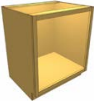
BC Base Cabinet

This is a full-height base cabinet with no drawers. Available with up to 2 adjustable shelves.