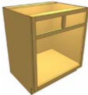
BCO1D2 Base Cabinet 1 Opening 2 Drawers

This base cabinet has two equal drawer opening at the top fixed at a height of 5in. Available with no shelves or with one adjustable shelf.