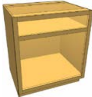
BCD1FS1 Base Cabinet 1 Drawer 1 Fixed Shelf

This base cabinet has a drawer opening at the top fixed at 5in. It also includes a fixed shelf behind the drawer rail. Works great for trashcan pull-outs or audio equipment for entertainment centers. Available with one adjustable shelf.