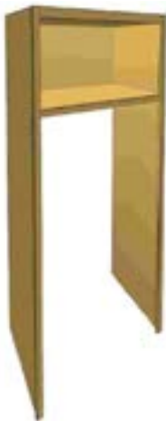
TREF71 Tall Cabinet 71in Refrigerator

This tall cabinet is designed for a built in appliance look. This cabinet already has legs extended 71in below the bottom of the cabinet. NOTE: The cabinet height you order should not include the leg height. Example: If you order this cabinet 25in tall, then your cabinet will come 96in overall height. Available with no shelves or with one adjustable shelf.