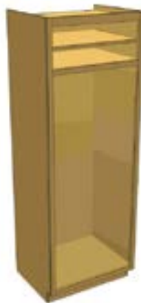
T56 Tall Cabinet Fixed Lower 56in

This tall cabinet has a fixed lower opening of 56in. The top opening is variable. Works great if you plan to use rollout drawers in the lower section. Also is ideal for a broom or utility cabinet. Available with up to five adjustable shelves.