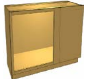
BCBLCR Base Cabinet Blind Corner Right

This cabinet is a blind corner base. It is configured to be installed 1in out of the corner. Available with no shelves or with one adjustable shelf.