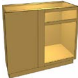
BCBLCLD1 Base Cabinet Blind Corner Left 1 Drawer

This cabinet is a blind corner base. It is configured to be installed 1in out of the corner. Available with no shelves or with one adjustable shelf.