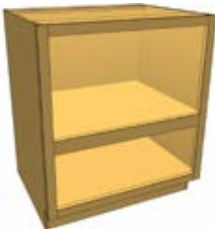
BCMICF015 Base Cabinet Microwave Fixed Opening 15 1/2

This base cabinet is built for a counter-type microwave or a built-in microwave with the proper trim kit. The bottom opening is variable and has indexing in the back for a drawer.