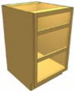
BCD3 Base Cabinet 3 Drawers

This is a 3-drawer base cabinet with one 5in top drawer opening and two equal height lower drawers.