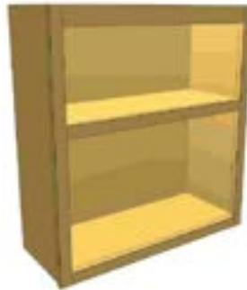
UCMICFO19 Wall Cabinet Microwave Fixed Opening 19 1/4in

This cabinet has a fixed 19.25in lower opening, and a variable height upper section. This cabinet is primarily designed for a built-in microwave upper. Available with up to two adjustable shelves.