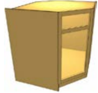
BCANGD1 Base Cabinet Angle Fixed Depth 1 Drawer

This cabinet is a 45 degree base corner. It works great as a sink base or a lazy susan. NOTE: Shelf must be installed BEFORE installing cabinet top.