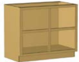
BCD4EO Base Cab 4 Drw Equal Opening

This is a 4-drawer base cabinet with all drawers having equal openings. Ideal for use as a filing cabinet or storage.