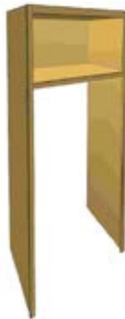
TREF72 Tall Cabinet 72in Refrigerator

This tall cabinet is designed for a built in appliance look. This cabinet has legs extended 72in below the bottom of the cabinet. Please note the cabinet height you order should not include the leg height. Example: If you order this cabinet 24in tall, then your cabinet will come 96in overall height. Available with no shelves or with one adjustable shelf.