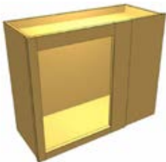
UCBLCR Upper Cabinet Blind Corner Right

This right blind corner upper cabinet is designed to sit 1in out of the corner of your wall corner. Available with up to three adjustable shelves.