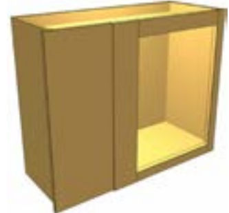
UCBLCL Upper Cabinet Blind Corner Left

This left blind corner upper cabinet is designed to sit 1in out of the corner of your wall corner. Available with up to three adjustable shelves.