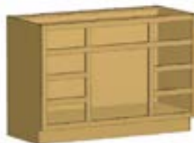
BCVCD9FO18 Vanity Cabinet 9 Drawer Fixed Opening 18in

Vanity Cabinet for single bowl application. The center drawer opening is a fixed size of 18in. This cabinet has one 5in top drawer opening and three equal height lower drawer openings of equal widths on each side of center opening. This cabinet does not include vertical partitions.