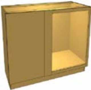
BCBLCL Base Cabinet Blind Corner Left

This cabinet is a blind corner base. It is configured to be installed 1in out of the corner. Available with no shelves or with one adjustable shelf.