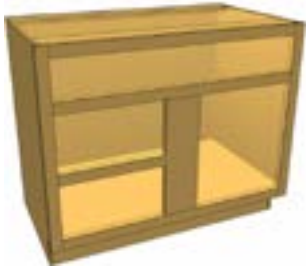
BCVCDL2 Vanity Cabinet 2 Drawer Left

Vanity cabinet for single bowl application. Left drawer and right door are equal widths.