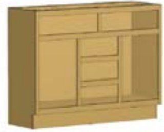
BCVCD5FO12 Vanity Cabinet Center 3 Drawer Stack Fixed at 12in Wide

This cabinet works well as a Double Bowl vanity. Contains a center stack of 12in wide drawers, with equal width openings on both Sides. Does not have shelves or vertical partitions.