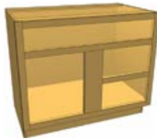
BCVCDR2 Vanity Cabinet 2 Drawer Right

Vanity cabinet for single bowl application. Right drawer and left door are equal widths.