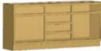
BCVCD6FO21 Vanity Cabinet Center 3 Drawer Stack L&R Fixed Opening 21in

Vanity Cabinet for double bowl application. This cabinet has three 5in top drawer openings and three equal height lower drawer openings. To the left and right of center drawer stack are fixed openings locked at 21in.