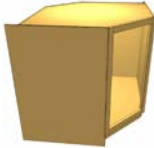
BCANG Base Cabinet Angle Fixed Depth

This cabinet is a 45 degree base corner. It works great as a sink base or a lazy susan. Available with no shelves or with one adjustable shelf. NOTE: Shelf must be installed BEFORE the cabinet top.