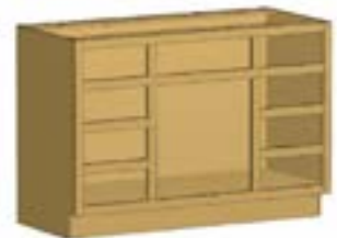
BCVCD9FO24 Vanity Cabinet 9 Drawer Fixed Opening 24in

Vanity Cabinet for single bowl application. The center drawer opening is a fixed size of 24in. This cabinet has one 5in top drawer opening and three equal height lower drawer openings of equal widths on each side of center opening. This cabinet does not include vertical partitions.