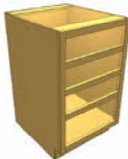
BCD4 Base Cabinet 4 Drawers

This is a 4-drawer base cabinet with three 5in top drawer openings and one variable height lower drawer opening.