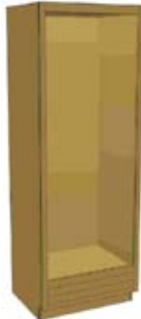
TOV Tall Oven

This cabinet comes with all the necessary parts to custom fit a variety of built in appliances like ovens and warming drawers or even a microwave. Cabinet is shipped with three rails and shelves that can be installed in any configuration that you will need. Cabinet is also line bored for easy shelf installation.