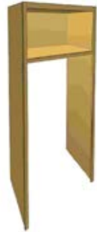
TREF70 Tall Cabinet 70in Refrigerator

This tall cabinet is designed for a built in appliance look. This cabinet already has legs extended 70in below the bottom of the cabinet. NOTE: The cabinet height you order should not include the leg height. Example: If you order this cabinet 26in tall, then your cabinet will come 96in overall height. Available with no shelves or with one adjustable shelf.