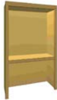
UCAG Upper Cabinet Appliance Garage

Upper cabinet with an 18in tall appliance garage. NOTE: The order height of your cabinet should not include the additional 18in height. Example: If you order this cabinet 30in tall, then your cabinet will come 48in overall height. Available with up to three adjustable shelves.