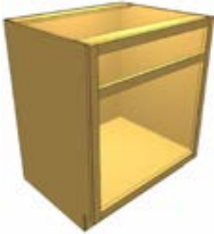
BCD1 Base Cabinet 1 Drawer

This base cabinet has a drawer opening at the top fixed at 5in. Available with no shelves or with one adjustable shelf.