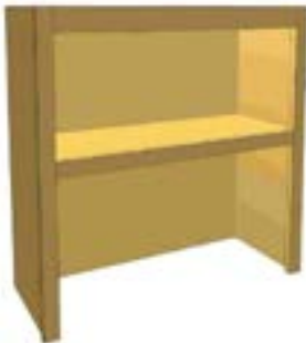
UCMICRFO15 Wall Cabinet Microwave OTR Fixed Opening 15in

This cabinet is designed for placement above a range to receive an over-the-range microwave. This cabinet has 15in drop down sides. NOTE: The order height of your cabinet should not include the additional 15in height. Example: If you order this cabinet 30in tall then your cabinet will come 45in overall height. Available with up to three adjustable shelves.