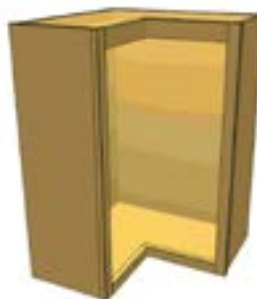
UCCOR Upper Cabinet Corner

This cabinet is a corner upper. NOTE: This unit is 12in-16in deep on each side. Available with up to three adjustable shelves.