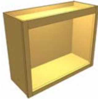
UC Upper Cabinet

This cabinet works well as an upper cabinet or bookcase. Available with up to six adjustable shelves.