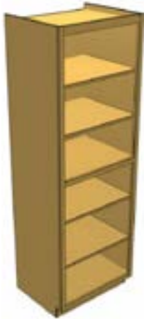
TEQ Tall Cabinet EQ 4 Shelves

This tall cabinet has two equal height openings. This cabinet has four shelves.