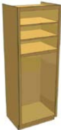
T485 Tall Cabinet Fixed Lower 48.5in

This tall pantry cabinet has a fixed lower opening of 48.5in. The top opening is variable. Works great if you plan to use rollout drawers in the lower section. Available with up to five adjustable shelves.