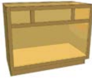
BCVCD2FO20 Vanity Cabinet Fixed Opening 20in 2 Drawer

Vanity cabinet for single bowl application. The center drawer front is a fixed size of 20in. The other two drawer openings are variable.