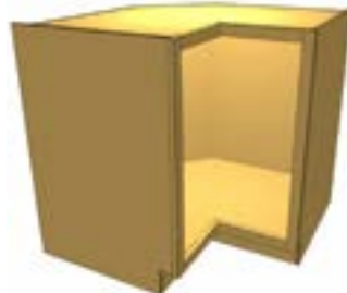
BCCOR Base Cabinet Corner

This cabinet is a 90 degree base corner. It works great with a shelf or with a lazy susan. Available with no shelves or with one adjustable shelf. NOTE: Shelf must be installed BEFORE installing cabinet top.