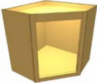
UCANG Upper Cabinet Angle Fixed Depth

Angled upper cabinet with 12-16in sides. With a five minute assembly time, this extremely profitable cabinet puts money straight into the shop owner's pocket. Available with up to three adjustable shelves.