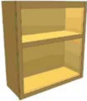
UCMICFO16 Wall Cabinet Microwave Fixed Opening 16 1/4in

This cabinet has a fixed 16.25in lower opening, and a variable height upper section. This cabinet is primarily designed for a built-in microwave upper. Available with up to two adjustable shelves.