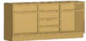
BCVCD6FO27 Vanity Cabinet Center 3 Drawer Stack L&R Fixed Opening 27in

Vanity Cabinet for double bowl application. This cabinet has three 5in top drawer openings and three equal height lower drawer openings. To the left and right of center drawer stack are fixed openings locked at 27in.