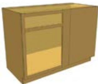
BCBLCRD1 Base Cabinet Blind Corner Right 1 Drawer

This cabinet is a blind corner base. It is configured to be installed 1in out of the corner. Available with no shelves or with one adjustable shelf.