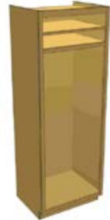
T64 Tall Cabinet Fixed Lower 64in

This tall cabinet has a fixed lower opening of 64in. The top opening is variable. Works great if you plan to use rollout drawers in the lower section. Also is ideal for a broom or utility cabinet. Available with up to five adjustable shelves.