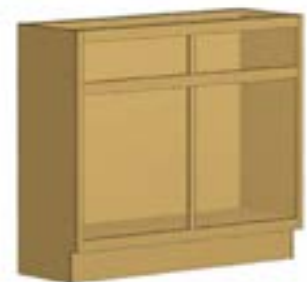
BCVCD2EO Vanity Cabinet 2 Drawer Equal Openings

This cabinet works very well as a double bowl vanity cabinet with equal drawer openings on each side. This cabinet does not have vertical partitions or shelves.