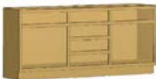
BCVCD6FO33 Vanity Cabinet Center 3 Drawer Stack L&R Fixed Opening 33in

Vanity Cabinet for double bowl application. This cabinet has three 5in. top drawer openings and three equal height lower drawer openings. To the left and right of center drawer stack are fixed openings locked at 33in.