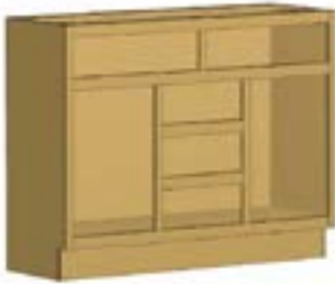
BCVCD5FO18 Vanity Cabinet Center 3 Drawer Stack Fixed at 18in Wide

This Cabinet works well as a Double Bowl vanity. Contains a center stack of 18in wide drawers, with equal width openings on both sides. Does not have shelves or vertical partition.